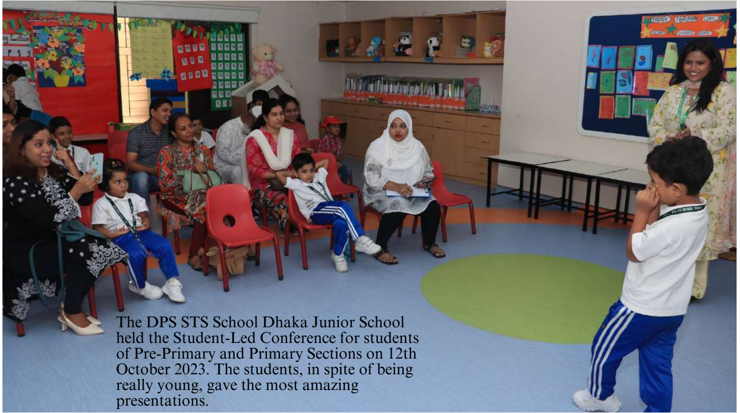
The DPS STS School Dhaka Junior School held the Student-Led Conference for students of Pre-Primary and Primary Sections on 12th October 2023. The students, in spite of being really young, gave the most amazing presentations.