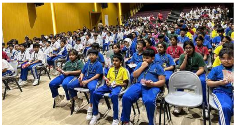
Grade 1 and 2 students had an informative Nutrition Session on 19th October 2023, led by Dr Umme Habiba Sultan from Dhaka Medical College Hospital. Students were also gifted sachets of Complan Drinks!